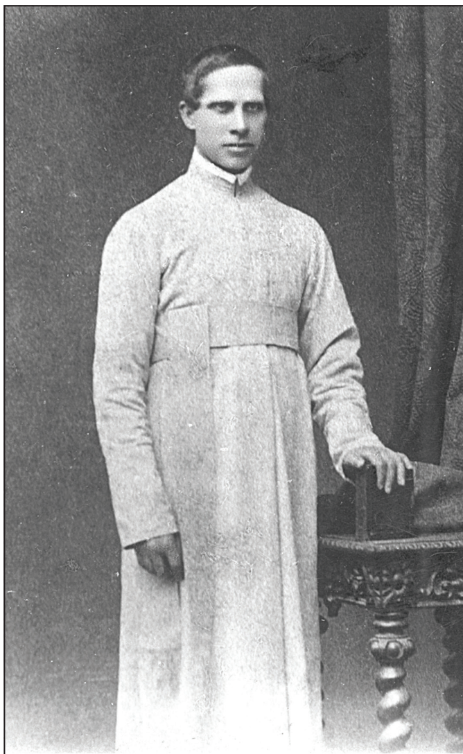
Father Casimir Pestynek, MIC (1828–1893). Photo from the second half of the 19 th century. Marian Fathers' Provincial Archives in Warsaw, Poland.